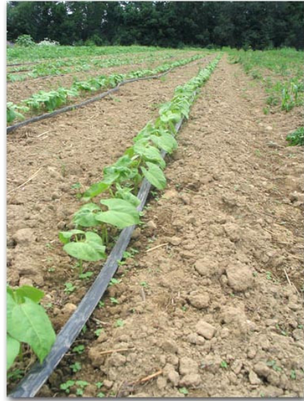
Drip Irrigation System

Traveling gun systems have the advantage of covering large field areas with each pass, but the high pressures at which they operate will cause you to spend more on fuel. In addition, large sprinkler water drops may damage some crops.